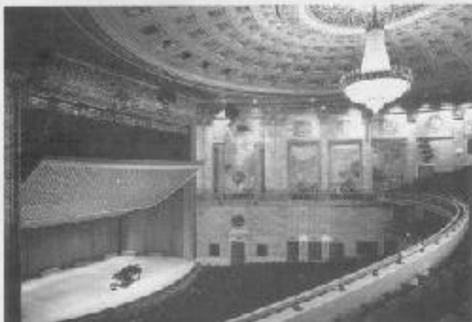
Photos, courtesy of Soundhelix, are of the Old South Meeting House, Boston, (top) and the Eastman Theatre at the University of Rochester (bottom).

Since the institution of the ADA, wireless sound transmission has grown from near obscurity to a major source of income for sound contractors. Both radio frequency (RF) and infrared (IR) systems have found a multitude of venues and applications. Originally, each had its distinct application and market. Now, the line between IR and RF has blurred; the principal difference between the two systems boils down to the method used to transport the audio signal to the end user. An RF system uses radio waves, while IR sys-