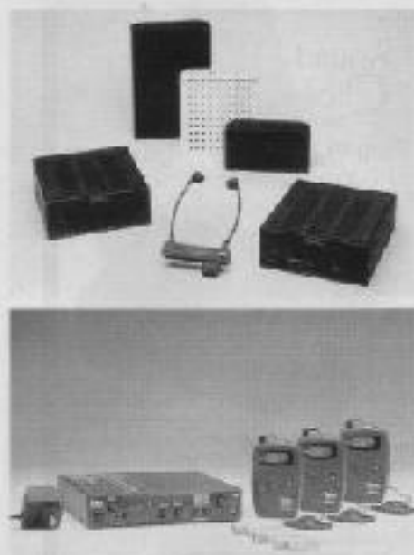
(Top) Sound Associates SA801 transmitter receiver and power supply. (Bottom) Listen Technologies LT-800 transmitter and LT-800 receiver.