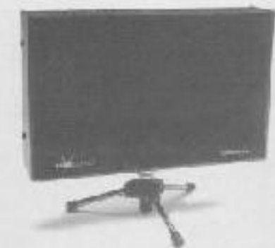
(Left) Audex's SoundMate personal listening systems.

In theaters like the Vivian Beaumont at Lincoln Center, New York City, where the audience sits on three sides of the stage, typical rules for focusing IR cannot be applied. Hanging emitters on the side of the stage and cross-focusing will put the highest concentration on the thrust of the stage. Angling them to cover the sides of the stage will leave a dead area in the center. Focusing the main emitters on the center area with a slight intersection and supplementing the seating areas to